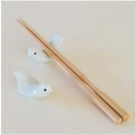
Lovebirds chopstick rests IC-Lovebirds Retail: $ 22.00