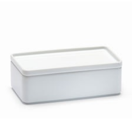
Sitaku - Butter Case KI-09655 Retail: $ 48.00