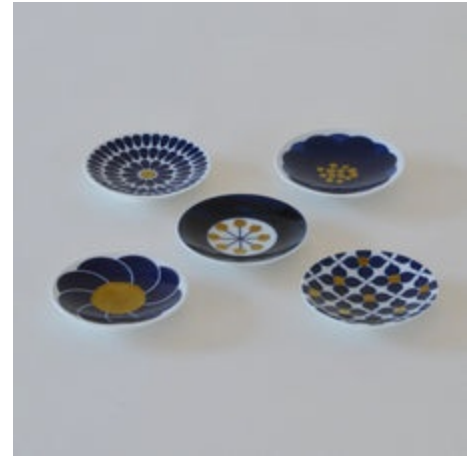
Bean Plates - Set of 5 KI-14677 Retail: $ 55.00