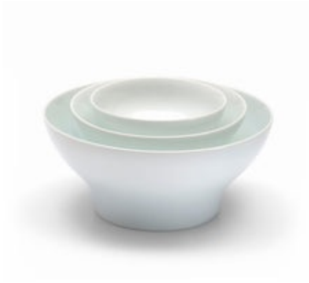
Houen Collection - Set of 3 Nesting Bowls KI-HOUENSET Retail: $ 95.00