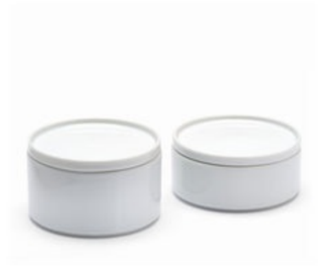
Sitaku - Storage Container Large KI-09654