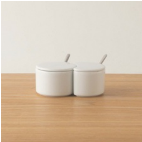
Spice Container Set - Round & Moon KI-14752/14753 Retail: $ 58.00