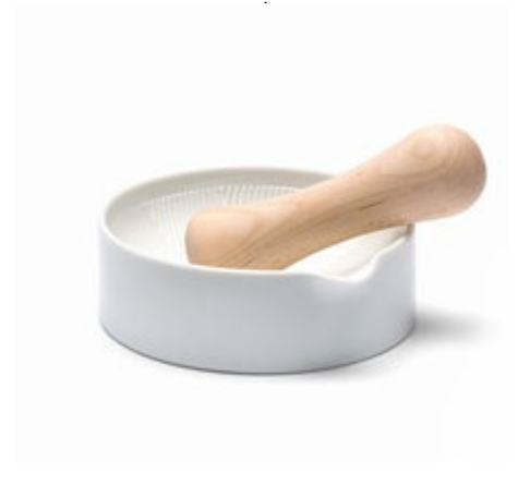
Sitaku - Mortar & Pestle KI-MP Retail: $ 45.00