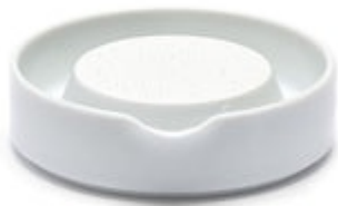
Sitaku - Ginger Grater KI-09650 Retail: $ 29.00