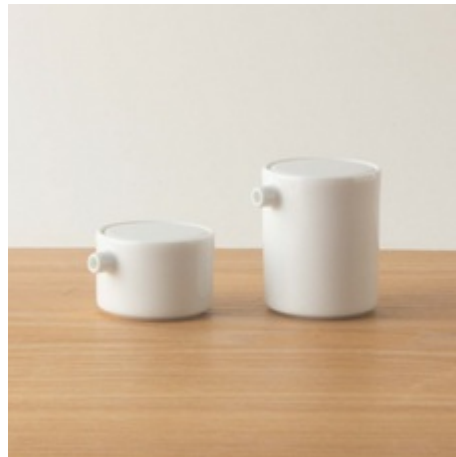
Sitaku - Soy Saucer Small KI-14750