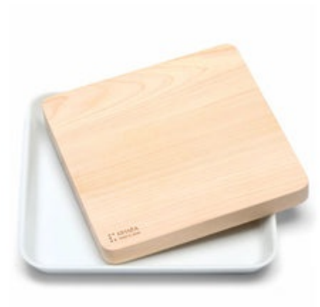
Sitaku - Cutting Board / Plate KI-14625 Retail: $ 115.00