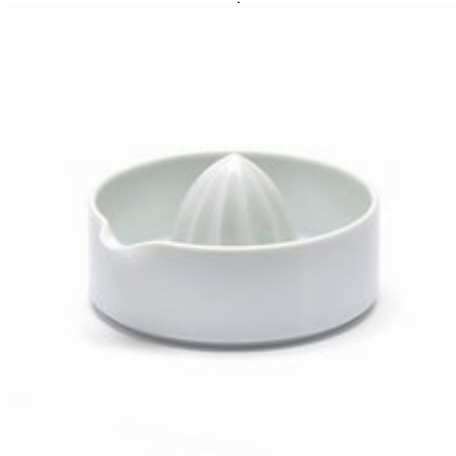
Sitaku - Lemon Squeezer KI-09651 Retail: $ 29.00