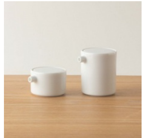
Sitaku - Soy Saucer Large KI-14751