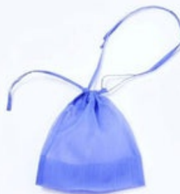
See Through Shoulder Bag Purple MM-SukerUS-ir Retail $ 59.00