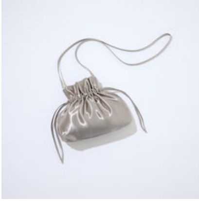
Shiny Shell Bag Iron MM-ShinShellB-ir Retail $ 80.00