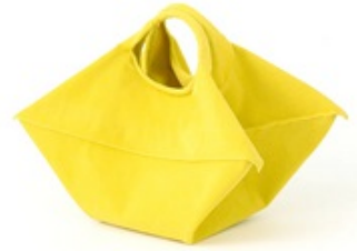
Horn bag Yellow MM-Horn-YE Retail $ 89.00