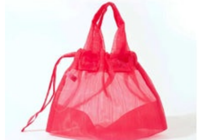
See Through Bag Pink MM-SukerUB-pk Retail $ 69.00