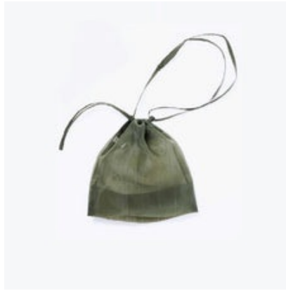
See Through Shoulder Bag Khaki MM-SukerUS-kh Retail $ 59.00