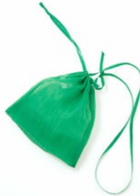
See Through Shoulder Bag Green MM-SukerUS-gr Retail $ 59.00