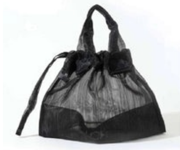
See Through Bag Black MM-SukerUB-bk Retail $ 69.00