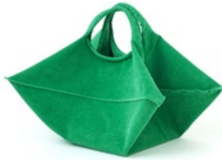
Horn bag Green MM-Horn-VG Retail $ 89.00