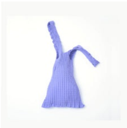
Stretchy Bag Purple MM-Nobirub-ir Retail $ 79.00