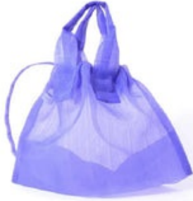
See Through Bag Purple MM-SukerUB-ir Retail $ 69.00