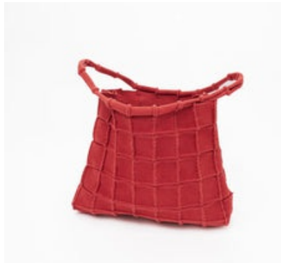
Tile Bag Brick MM-Tileb-rg Retail $ 89.00