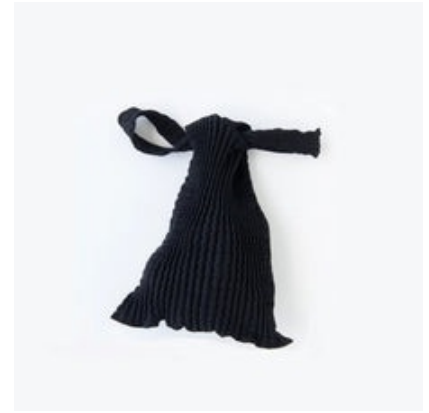
Stretchy Bag Black MM-Nobirub-bk Retail $ 79.00