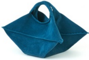
Horn bag Dark Green MM-Horn-DG Retail $ 89.00