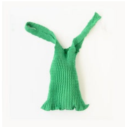
Stretchy Bag Green MM-Nobirub-gr Retail $ 79.00