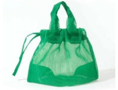
See Through Bag Green MM-SukerUB-gr Retail $ 69.00