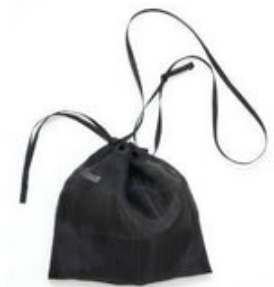
See Through Shoulder Bag Black MM-SukerUS-bk Retail $ 59.00