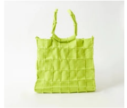
Tile Bag Lime Green MM-Tileb-lg Retail $ 89.00