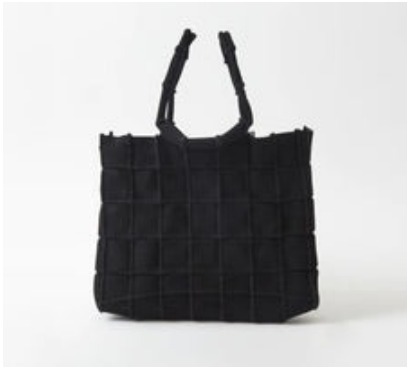
Tile Bag Black MM-Tileb-bk Retail $ 89.00