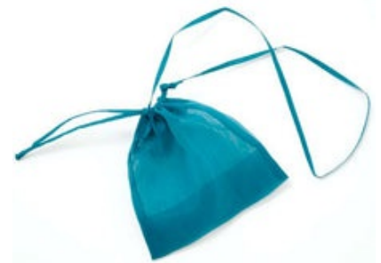
See Through Shoulder Bag Teal MM-SukerUS-pc Retail $ 59.00