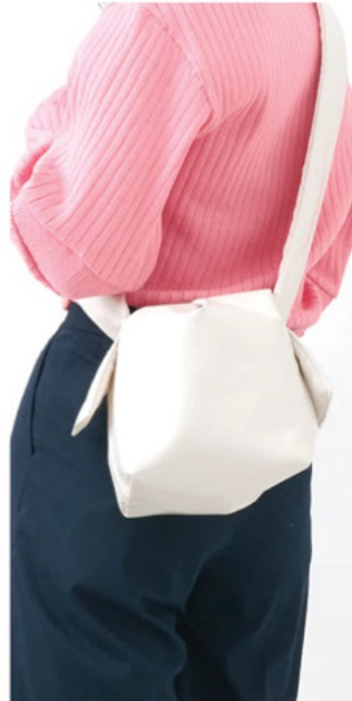
Tekateka shoulder bag