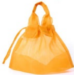
See Through Bag Orange MM-SukerUB-ob Retail $ 69.00