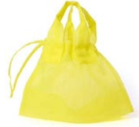
See Through Bag Yellow MM-SukerUB-lm Retail $ 69.00