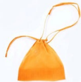
See Through Shoulder Bag Orange MM-SukerUS-ob Retail $ 59.00