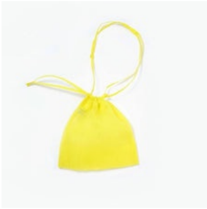
See Through Shoulder Bag Yellow MM-SukerUS-Im Retail $ 59.00