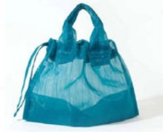
See Through Bag Teal MM-SukerUB-pc Retail $ 69.00