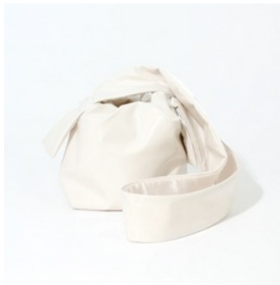
Tekateka Shoulder bag White MM-Tekasho-WH Retail $ 69.00