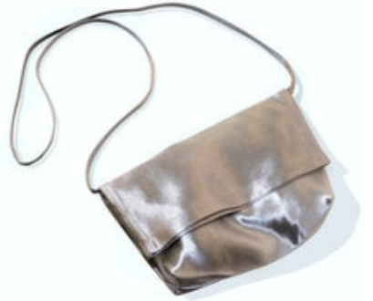
Shiny Fold Bag Iron MM-ShinShoB-ir Retail $ 70.00