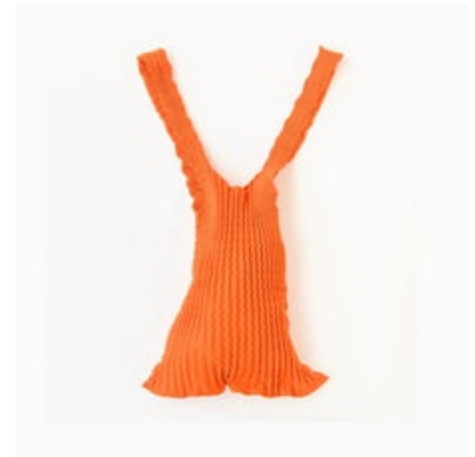
Stretchy Bag Orange MM-Nobirub-or Retail $ 79.00