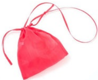
See Through Shoulder Bag Pink MM-SukerUS-pk Retail $ 59.00