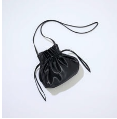
Shiny Shell Bag Black MM-ShinShellB-bk Retail $ 80.00