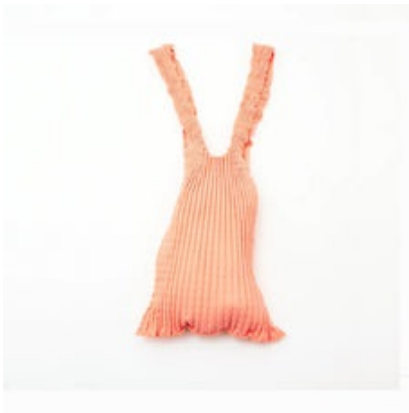
Stretchy Bag Coral MM-Nobirub-ap Retail $ 79.00