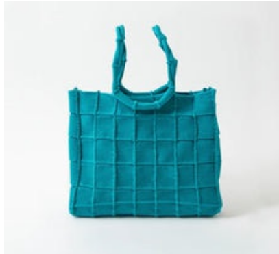
Tile Bag Light Blue MM-Tileb-gr Retail $ 89.00