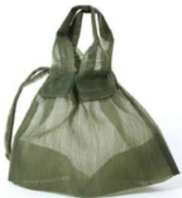
See Through Bag Khaki MM-SukerUB-kh Retail $ 69.00