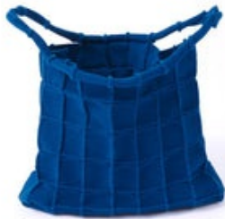
Tile Bag Navy MM-Tileb-nv Retail $ 89.00