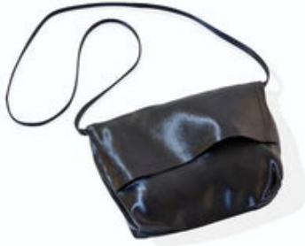
Shiny Fold Bag Black MM-ShinShoB-bk Retail $ 70.00