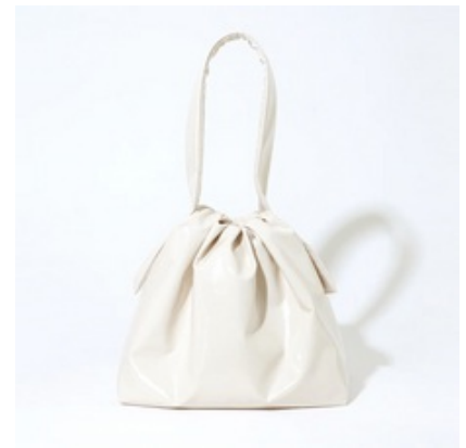
Tekateka Tote bag White MM-Tekatote-WH Retail $ 100.00